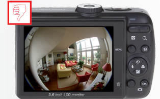
Zoom In Active: No Circular Image