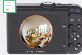
No Zoom: OK

Make sure that you can see the full circular image on the LCD monitor. Zoom position to minimum.